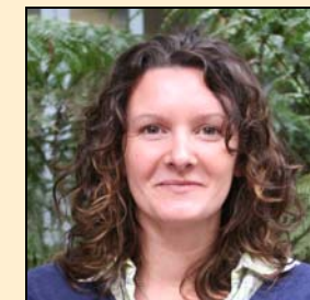
TOWNSEND Esher HNEAHS

Can analysis of compliments and patient satisfaction provide opportunities for service improvement in health?